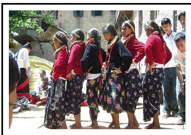
Dancing is a popular pastime for Children's Clubs