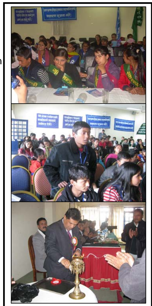
Above: photographs of delegates at the model parliament