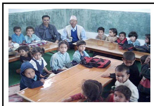
A child-friendly classroom, providing better educational opportunities to primary level kids

In the summer, in partnership with World Vision Nepal, GAN began a 4-year programme to improve education in the district of Lalitpur. The programme focuses on activities such as teacher training and improving school infrastructures, combined with innovative activities such as engaging parents and students in the management of schools and providing extra-curricular activities. Through this work GAN aims to raise the standards of education for children in the district and build a bright foundation for their future.