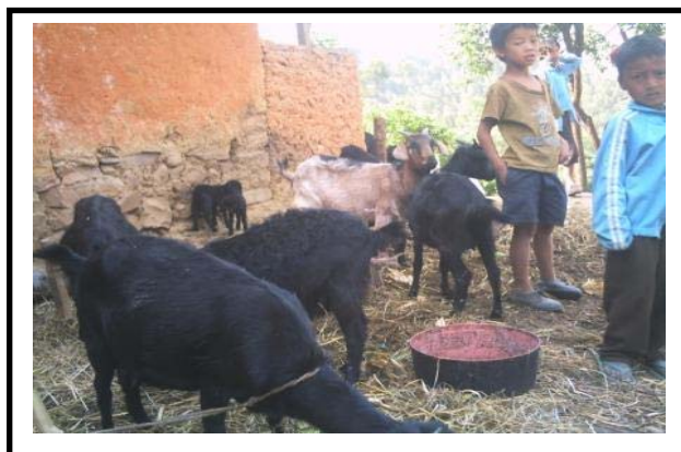
Cows are often a desirable purchase by those who are involved in GAN's microcredit programmes

By setting up seed funds and low-interest loans, GAN has enabled families to start businesses and make money, helping their children to learn for longer.